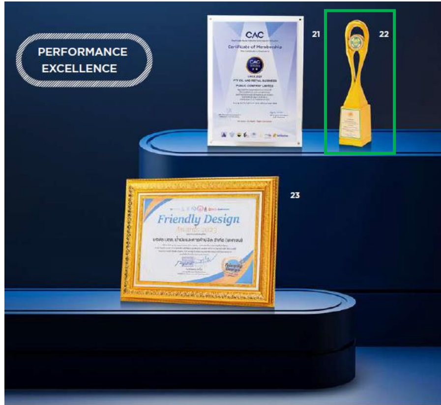
21. Membership status certification of Thailand's Private Sector Collective Action Against Corruption (CAC) Corruption Coalition Committee (first time applying for certification).